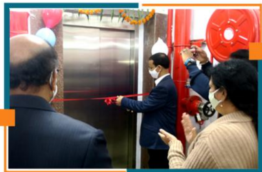
Inauguration of Patient Elevator