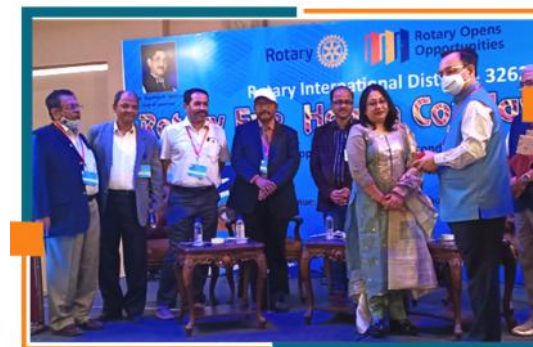
State Level Eye Health Conclave