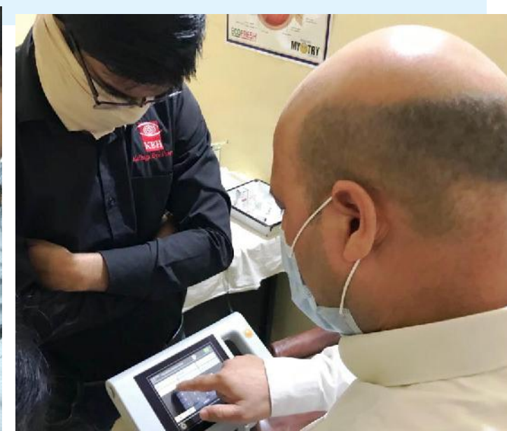
Vision Screener (Plus Optix)