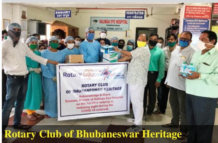
Rotary Club of Bhubaneswar Heritage

The COVID-19 pandemic has been an unprecedented time, including for those working in philanthropy. It has changed the face of philanthropy and philanthropic outreach completely, and perhaps even permanently. We have seen philanthropic resources at large being diverted to fight COVID-19.