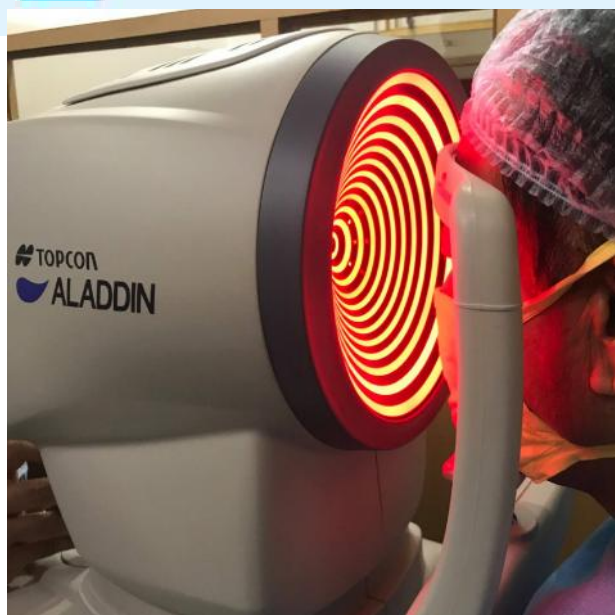
Optical Biometer (Tocon)

The dawn of advanced vision technologies has launched a new age in eye care and eye care equipment. The result of these sophisticated innovations is improved results. It is now possible to prevent vision disorders and eye diseases with lens-based equipment crafted to accurately track changes in eye pressure in order to enact timely therapeutic interventions. Newer methods are more effective than ever, and computerized eye evaluations are more prompt. In conclusion, newer vision technologies ensure that eye disorders can now be diagnosed earlier, eye surgery is less risky, and recovery time is faster.