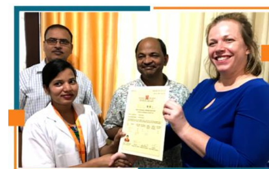
VT Certificate distribution