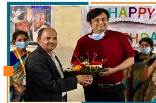
Birthday celebration of Doctors