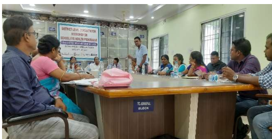
Stakeholder meeting at District Education Office, Keonjhar