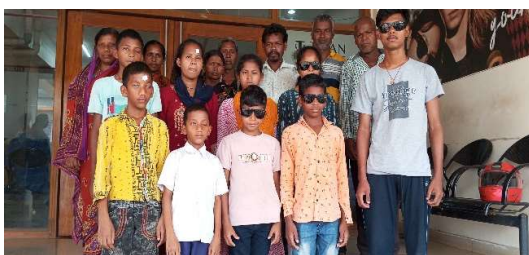
Children operated for Sight restoration Surgery