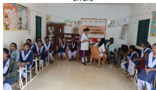
Screening of Children in Telkoi Block