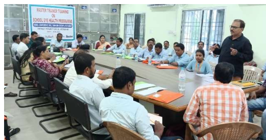
Creating Master Trainers for Training of the Teachers