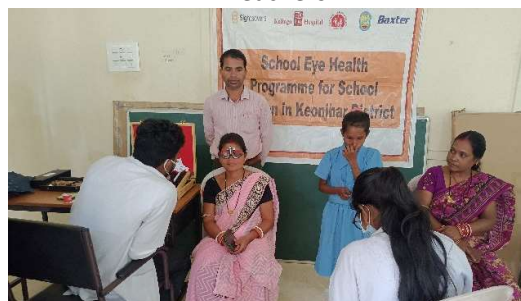
Screening of School Teachers for refractive errors