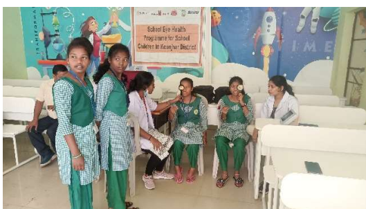
Screening of Children in Banspal Block