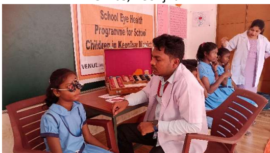
Screening of Children in Jhumpura Block