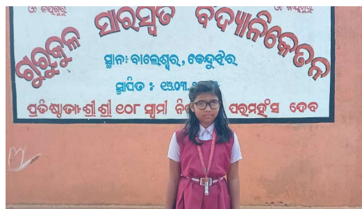
Providing Spectacles to Children with Refractive Error