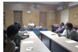
Hon'ble Collector of Angul suiting in the centre during the meeting

oped by Kalinga Eye Hospital. The decision was made that the corporate bodies would work together with the region's governing bodies to help eradicate preventable blindness.