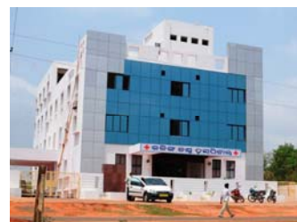
The newly made Kalinga Eye Hospital at Dhenkanal, Orissa

both national and international organizations for its contributions to health care and community development. KEHRC is registered under the Clinical Registration Act of Orissa and is a unit of the National Youth Service Action and Social Development Research Institute (NYSASDRI). NYSASDRI is renowned for its contributions to rural community development in Orissa and has been accepted as an Associate Member of the United Nations Department of Public Information. KEHRC has received the District Award of Dhenkanal for three consecutive years in recognition of performing a record number of cataract surgeries. KEHRC is also an Associate