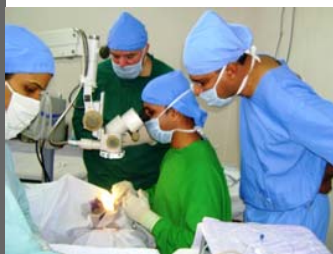
Hands on training inside the OT during the Hospital Base Program