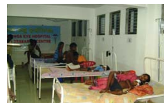
Paediatric cases after being operated are taking rest at the Paediatric ward of KEHRC

of the district head quarter hospital on the 3 rd of August, where all identified children will be brought, screened, and given appropriate treatment. The local ophthalmic assistants of different blocks of Angul were intimated and the teachers were informed to identify children with any type of ophthalmic problems. Around 186 children were brought to the screening spot on the 3 rd of August 2009, out of which 51 underwent surgical procedures at Kalinga Eye Hospital. To sustain the pediatric eye care services in the district, such type of treatment camps will be organized every year, said the collector cum district magistrate of Angul.