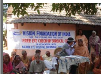
One of the eye screening camp organized at Angul of Orissa in support with Vision Foundation of India

organization is not only restoring the eyesight of the poor people by sponsoring surgeries, but also developing the local skills and knowledge about eye care by sending the international volunteers to strengthen the community of ophthalmology at Kalinga Eye Hospital.